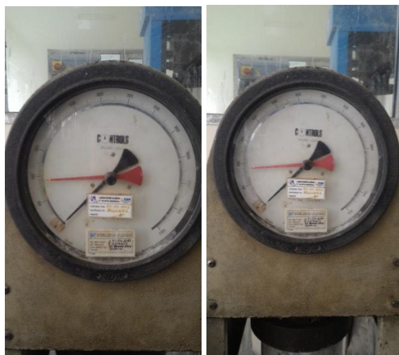
Hasil Uji Kuat Tekan