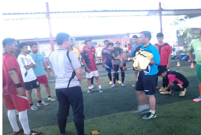
Pelatih membagi atlet menjadi dua kelompok