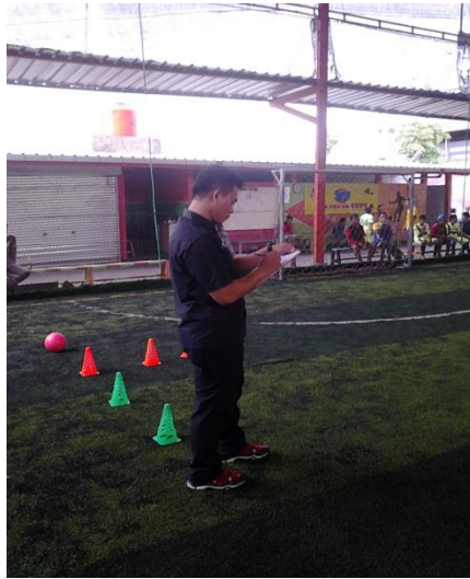
Kolaborator mengamati dan menilai aktivitas atlet