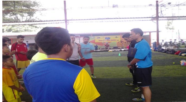
Klub melakukan doa bersama