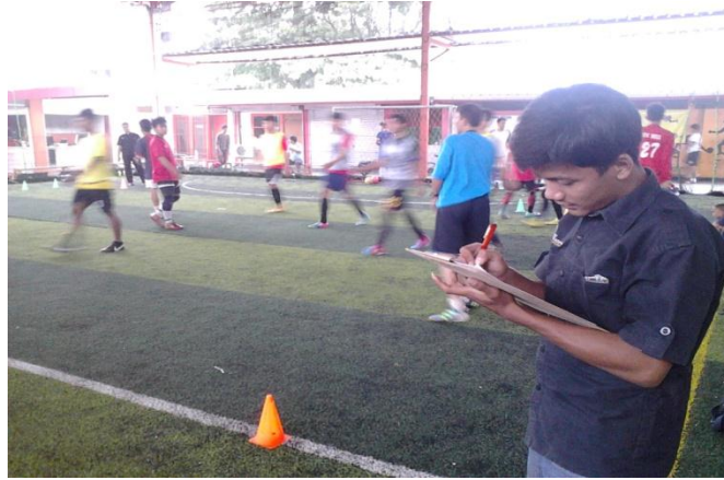
Kolaborator mengamati aktivitas pelatih