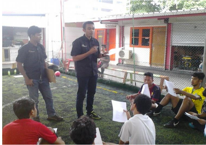
Peneliti menjelaskan cara pengisian kuisioner