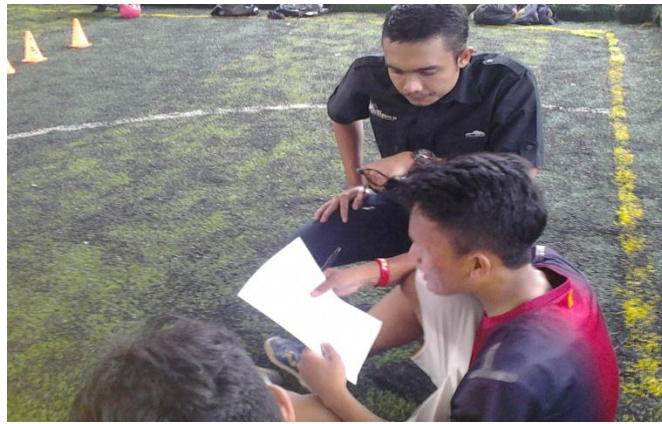
Responden mengajukan pertanyaan kepada peneliti