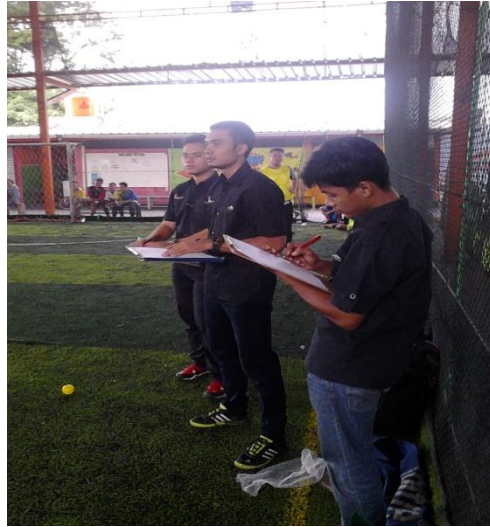
Peneliti dan kolaborator mengamati aktivitas secara keseluruhan