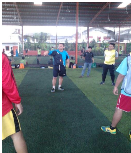
Pelatih memberikan arahan dan aturan permainan