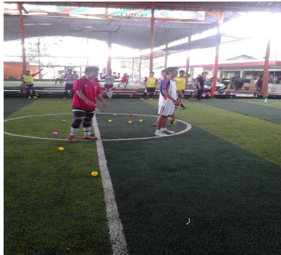
Atlet melakukan aktivitas pemanasan dengan permainan tradisional