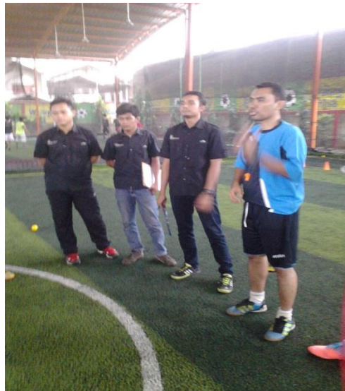
Pelatih menjelaskan manfaat/kegunaan permainan