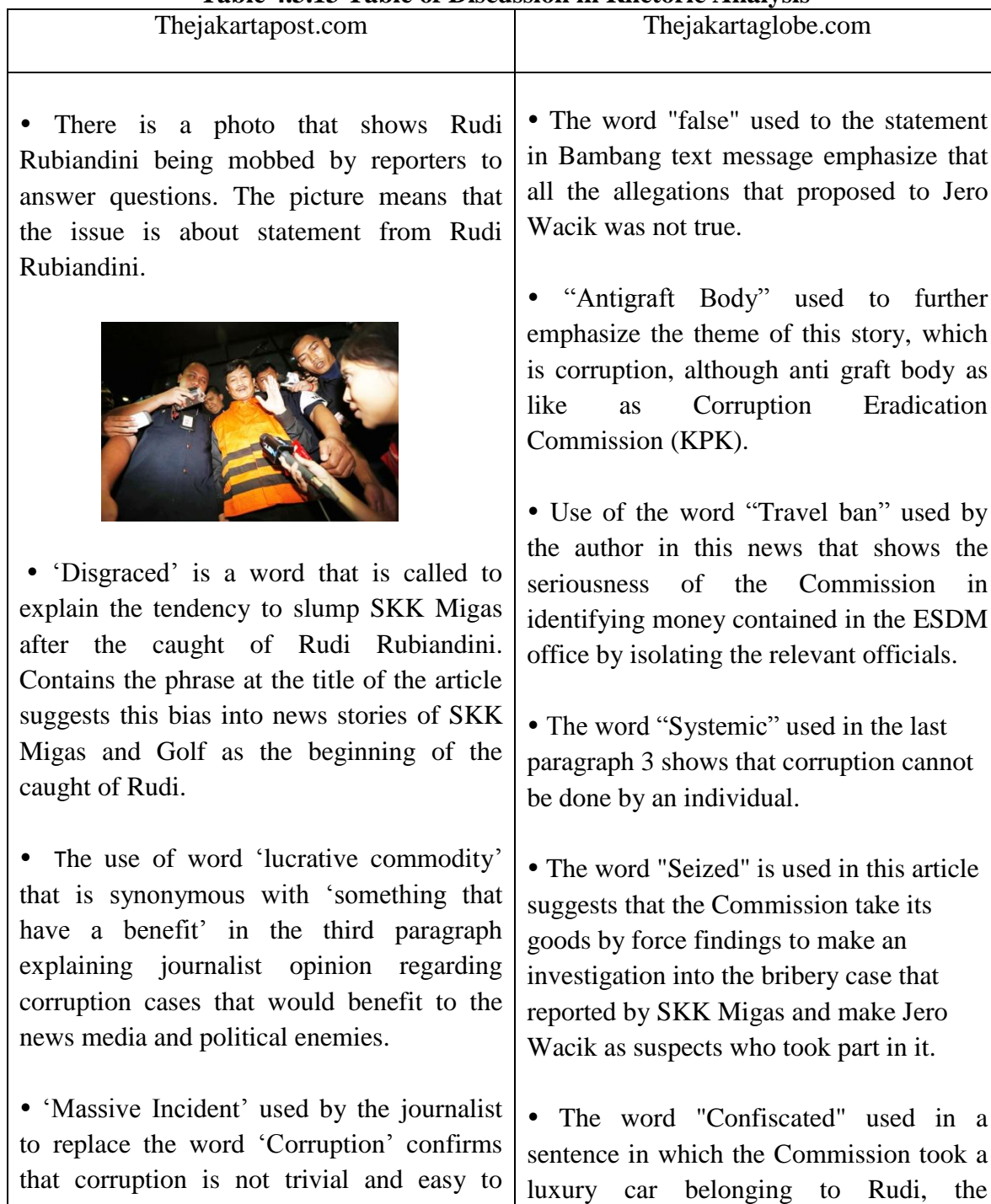
Table 4.3.13 Table of Discussion in Rhetoric Analysis