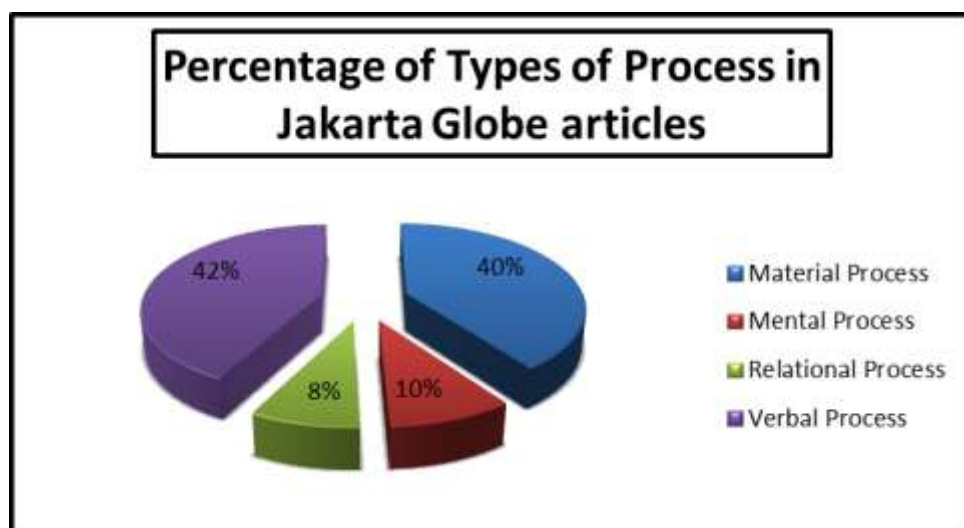
Chart 4.2. Percentage of Types of process in Jakarta Globe articles